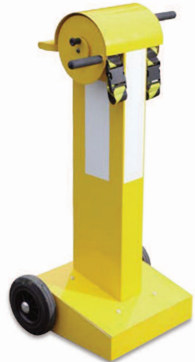
APGII - Advanced Pedestrian Guidance

The APG II is exclusively designed for the airline industry.