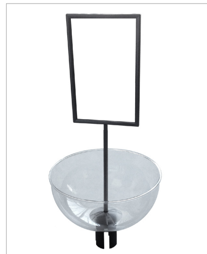
Available with optional sign frame