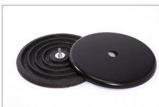
Cast iron base