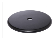
Replaceable base cover