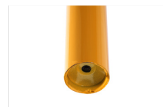
Heavy gauge steel construction