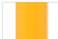
High visibility yellow finish