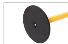
Full coverage floor protector