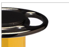
Forged rope loop