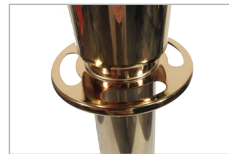
Stamped Rope Loop