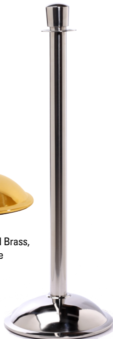
Crown Top, Polished Stainless, Dome Base