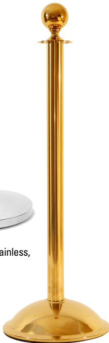
Ball Top, Polished Brass, Dome Base