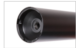
0.039 Gauge Steel/ Stainless Steel