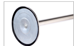
Full circumference floor protector