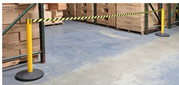
QueuePro 300 16'/4.9m Belt