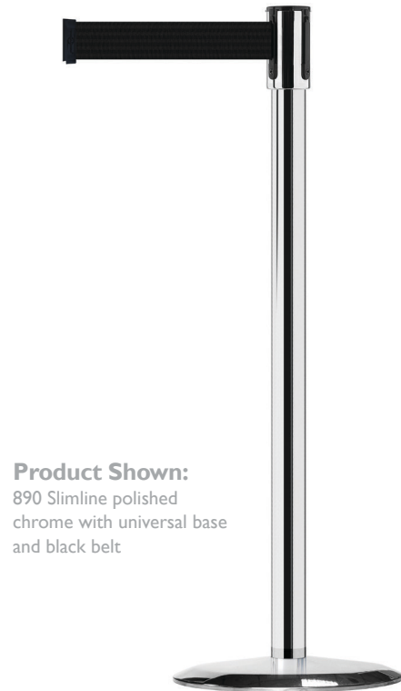
Product Shown: 890 Slimline polished chrome with universal base and black belt