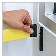
panic break belt end