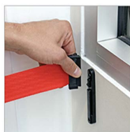
standard belt end