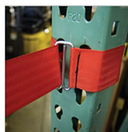
s-clip belt end