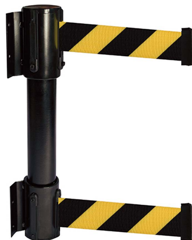
Product Shown: 896T2 Dual Line Wall Unit

For over a century, Tensator has been organizing the movement of people from point A to B. Our quality and attention to detail can be easily found in our Tensabarrier® product range, the world's first and largest range of retractable belt barriers.