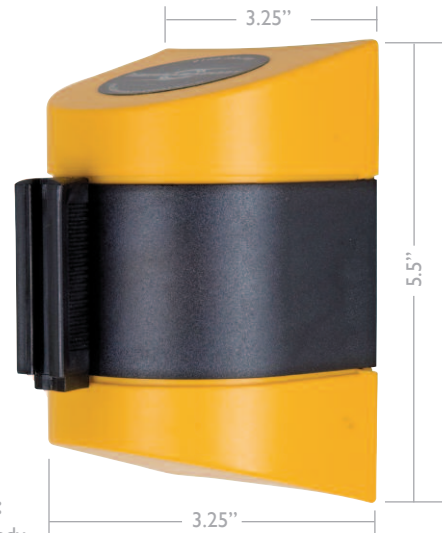
Product Shown: 897 Wall Unit black body with yellow caps